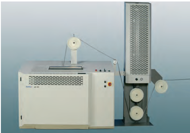
Komax ads 123 with optional linear storage unit