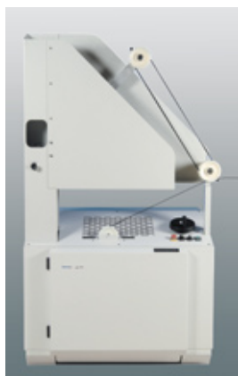
Komax ads 117