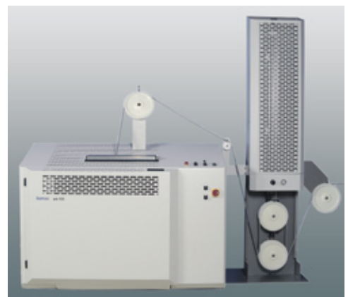
Komax ads 123