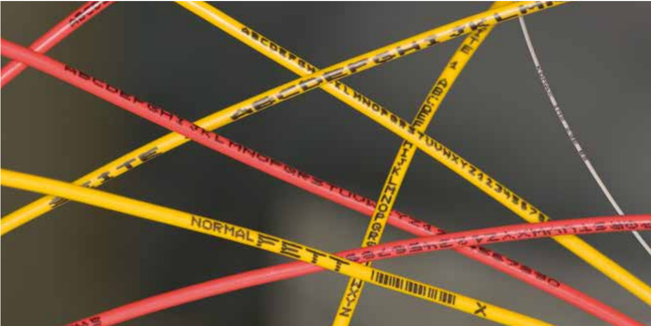
▲ Marking samples Done on the ims 295 BC and ims 295 BS

The ink system meters out just the amount of solvent required and constantly measures ink density to ensure economical and ecological operation. An optional solvent recovery system additionally minimizes solvent use and emissions.