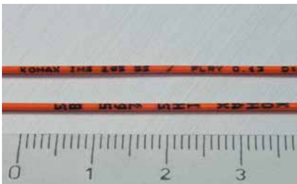
▲ Marking sample Printed with ims 295 BS, 0.13mm 2 cable (AWG26)