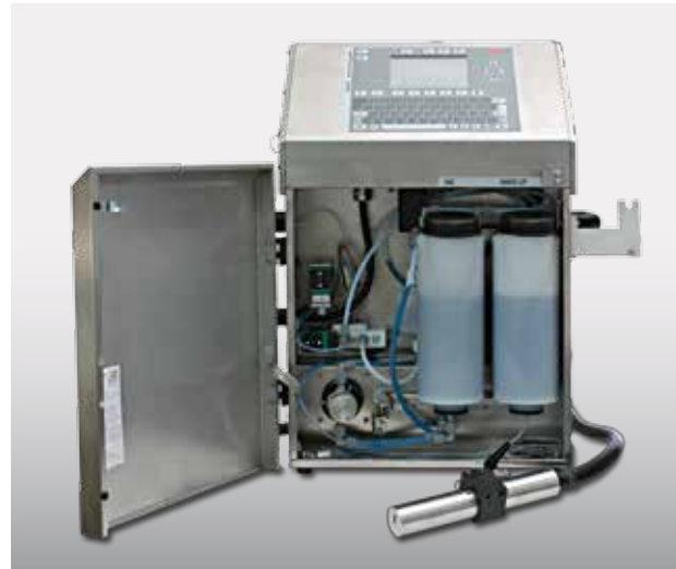
▲ Ink system Neat and reliable

The marking can be ideally positioned on the cable as required: