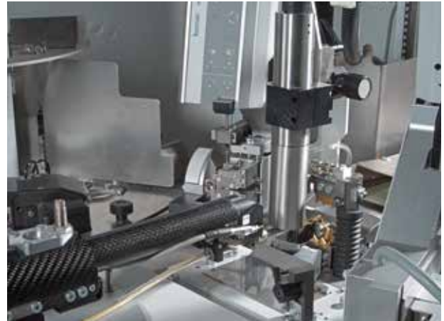
▲ ims 295 on Alpha 455 Minimal zero-cut, as the print head is positioned close to the cutting head

The ims 295 inkjet systems are ideally coordinated for use on fully automatic wire processing machines in the Kappa, Alpha, Gamma and Zeta series. They have an Ethernet interface (TCP/IP) and an RS232 interface and are compatible with future, current and earlier machines. With the leadset editor of the machine control, the marking text, the font and the (marking) position can be easily defined.