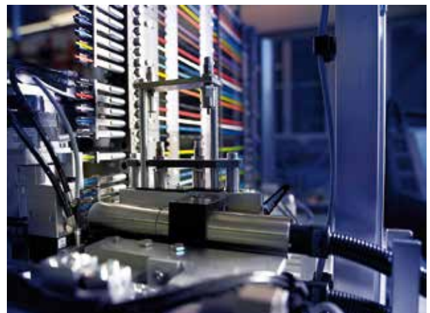
▲ Automatic marking head changer on Zeta Cable replacement without operator intervention, thanks to automatic text centering