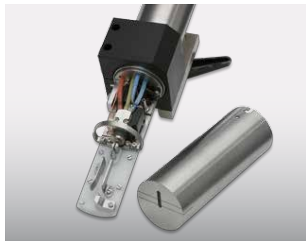
▲ Marking head With magnetic jet locking system

Other default settings are normal and bold font, font height and width, double spacing, inverse font and automatic adjustment of the center line to the cable diameter. This centering is provided for use with automatic cable change (Zeta-machines).