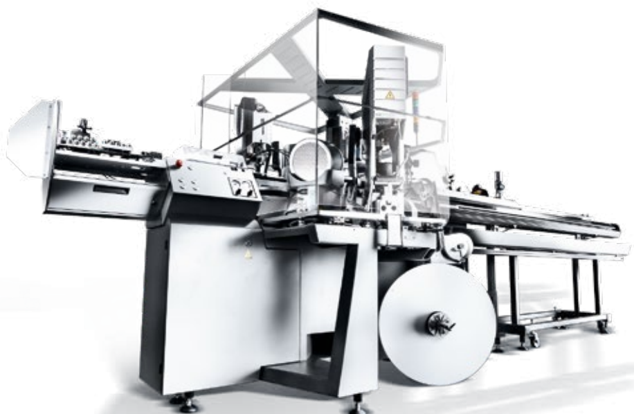
Alpha 550 Fully automated wire assembly