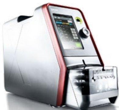
Mira 230 Programmable wire stripper

Teamwork at Komax is a matter of give and take. We are committed to ensuring that you feel at ease in an inspiring work environment. You can develop your skills here, help shape our company and be highly motivated to give your very best. If you are qualified, there are opportunities for a specialist or management career. In short: with us, you'll find career prospects tailored to your ambitions and skills.